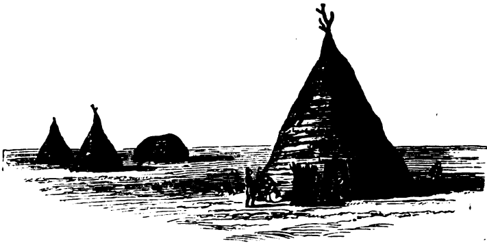
Wigwams of the natives of the Island of Jura, in the year 1772. (Copied from "Pennant's Second Tour.")

summer habitations of these Jura islanders are particularly described by Pennant, and they closely resemble the dwellings of the natives of Lochaber, as pictured by that traveller. Lochaber, which lies some distance to the north-east of Jura (though within easy reach of it by water), was stated to be the country of the "Moorish," or semi-Pictish, tribe of the Cattanachs, or Clan Chattan. Of their dwellings, at the time of his first visit to the Highlands, Pennant says: "The houses of the peasants in Lochaber are the most wretched that can be imagined; framed of upright poles, which are wattled; the roof is formed of boughs like a wigwam, and the whole is covered with sods." In his second tour he describes the summer dwellings of the Jura islanders in similar terms: "These formed a grotesque groupe; some were oblong, many conic, and so low that entrance is forbidden without creeping through the little opening, which has no other door than a faggot of birch twigs placed there occasionally. They are constructed of branches of trees, covered with sods; the furniture a bed of heath, placed on a bank of sod; two blankets and a rug; some dairy vessels, and above, certain pendant shelves, made of basket-work, to hold the cheese, the produce of the summer." The annexed woodcut is copied from the illustrations in Pennant's travels.